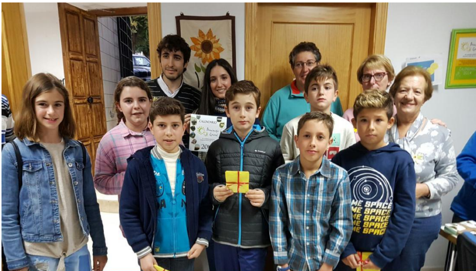
Competition winners and Association Members 2018

As an exception, the 2018 calendar was illustrated with photographs chosen from a competition for local primary school children and also adults. For our 2019 calendar we reverted to children's drawings on the theme "Love for Life".