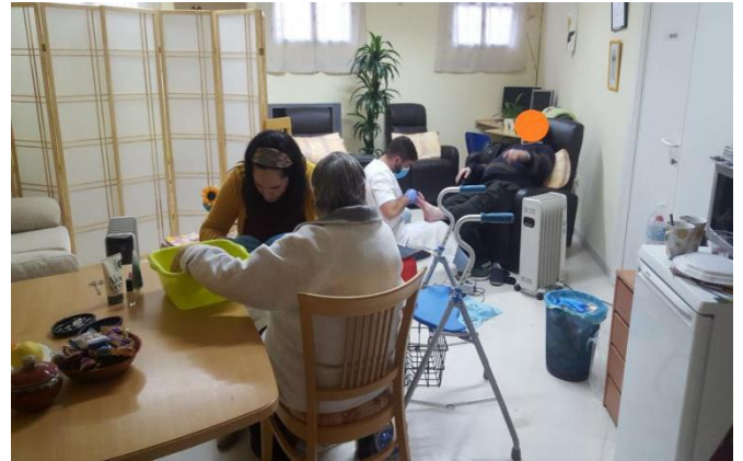
Chiropody session and manicure in the Day Hospice.

It's now our third anniversary of running the Day Hospice, at our premises within the former Casa de la Cultura of Alameda, where patients and their families are invited once a week, perhaps for breakfast, to receive physiotherapy sessions and/or complementary therapies, or simply for a break. This is entirely free of charge (as are all our services) and under the supervision of a specialist nurse and carer.